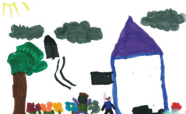
Ashton Starr - Grade 3